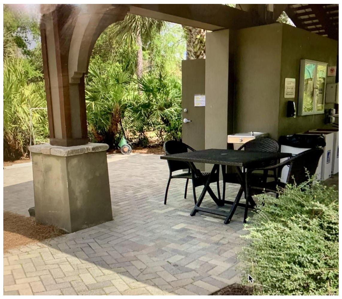
All we need now is a Bocce potluck! But, no worries! Think positive for 2021/22!