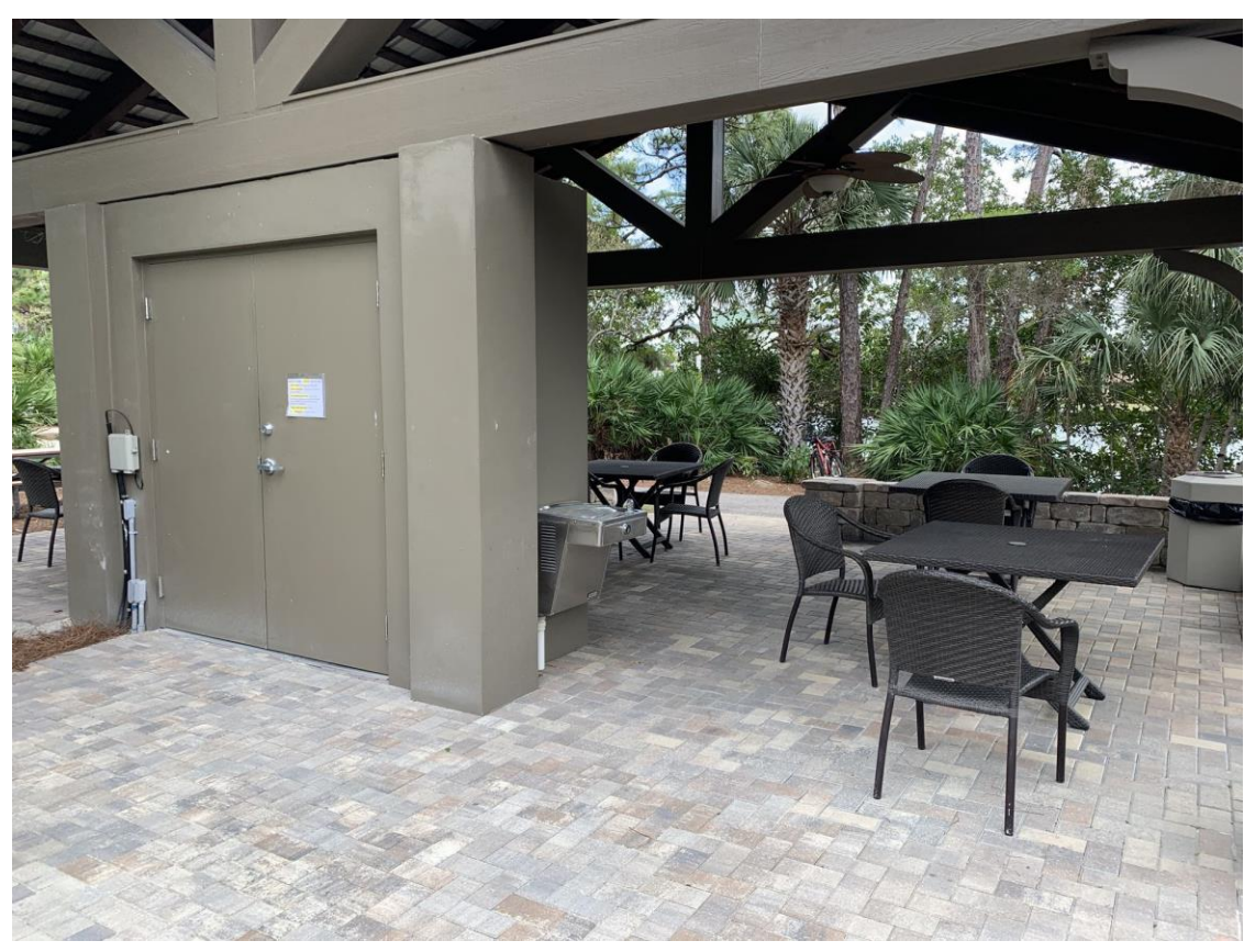
Lots of extra room!